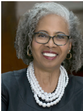
Gloria Ladson-Billings AUG 15 & 16, 2018

How do you create a true learning partnership between educators and students? How do you harness student voice, engagement, and efficacy to empower every learner to achieve at higher levels? Register now for WOW 2018-19! Your school-based team of 4-12 educators will work closely with nationally-recognized education leaders to develop and implement clear action steps that are: 1) tailored to meet your local needs; 2) maximize Educator Effectiveness as a process of continuous improvement; and 3) integrate with your ongoing school or district improvement strategies. Registration is FREE!